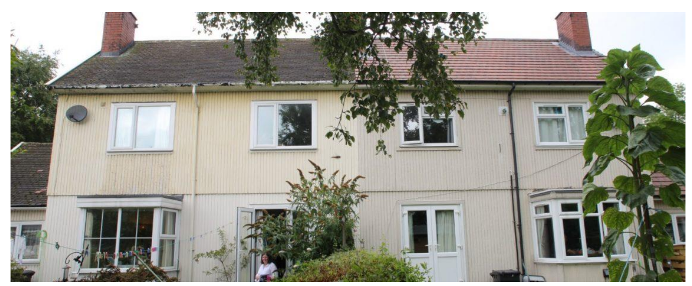
Swedish Houses Type A, rear view, Pool-in-Wharfedale (Prefab Museum)