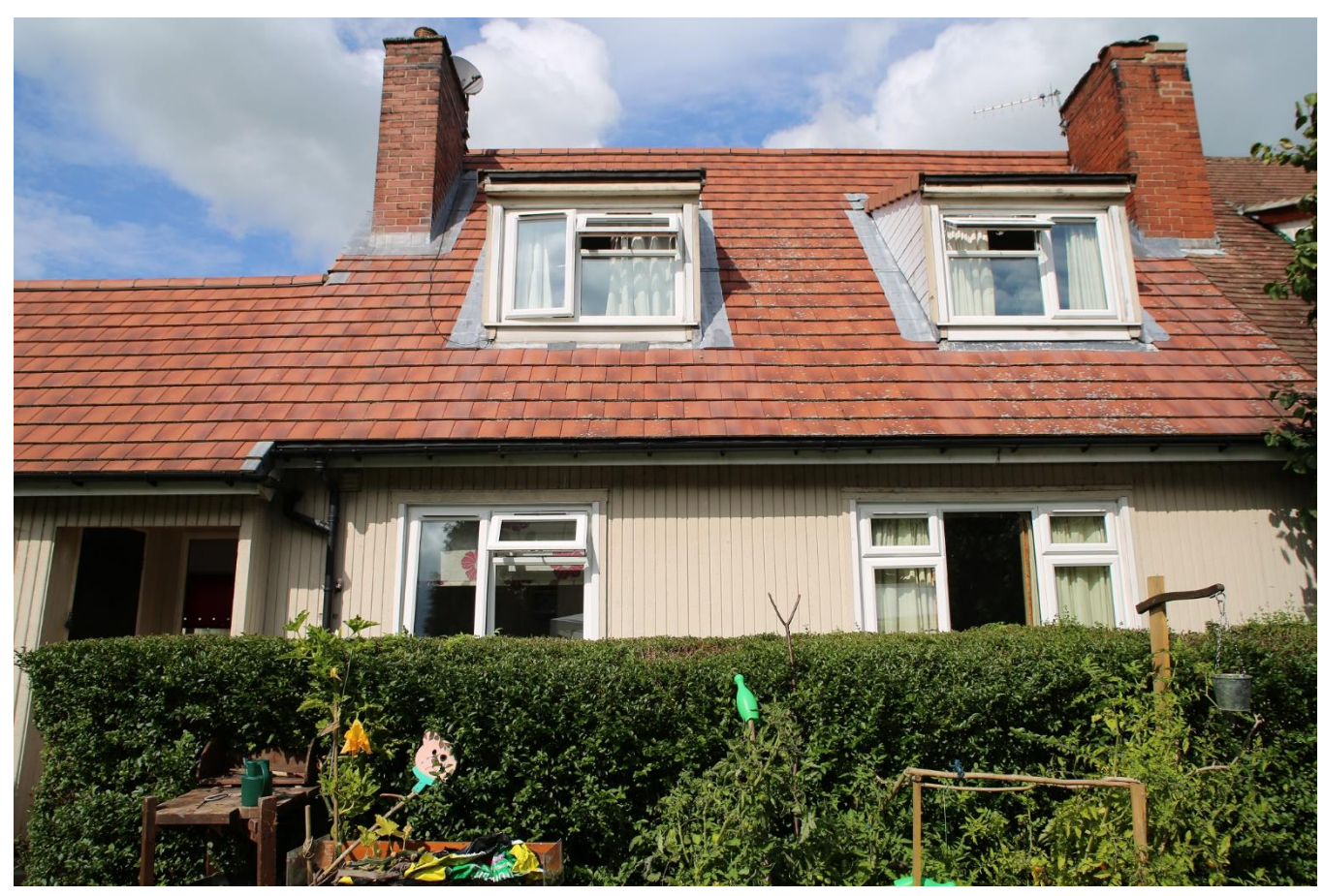
Type D Dormer Bungalow, rear view, Pool in Wharfedale (Prefab Museum)