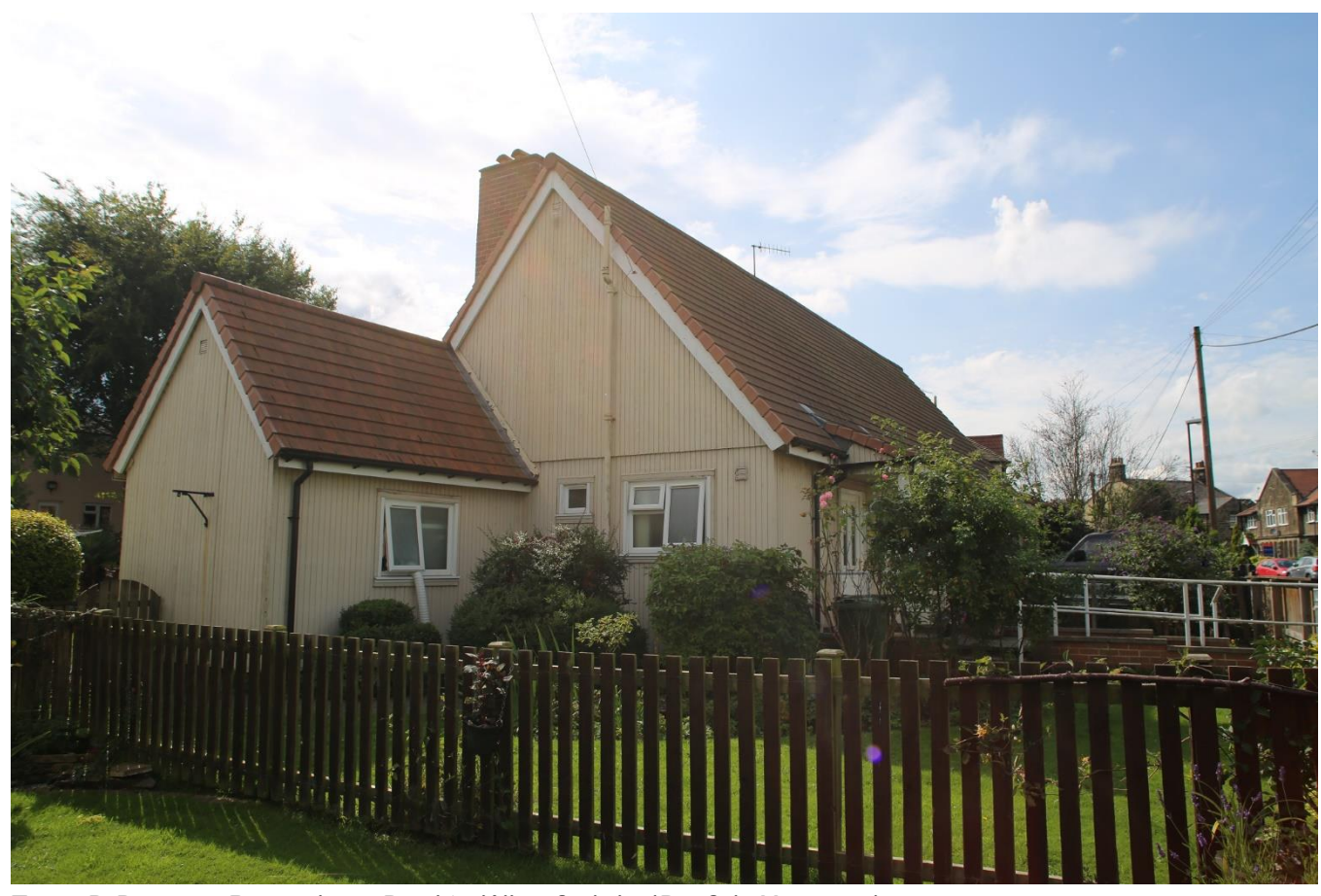
Type D Dormer Bungalow, Pool in Wharfedale (Prefab Museum)