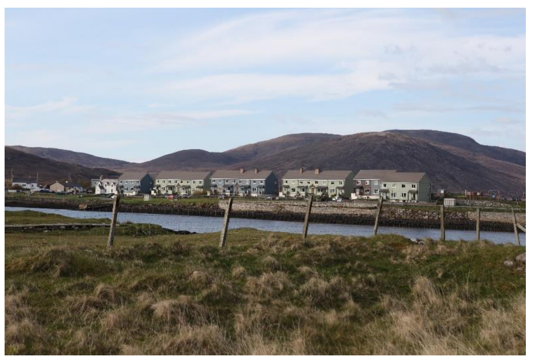
Swedish Houses Types B and C, Leverburgh, Harris (Elisabeth Blanchet)

However, by far the majority in Scotland were erected in larger estates within towns and cities. Two estates of 50 homes each still remain In Edinburgh (in the West Pilton and Sighthill areas). The Glasgow Balornock development is even larger. Cooke's paper<sup>(9)</sup> gives it a number of 200 with a total of 3,500 for Scotland as a whole. In fact there appears to be 306 in Balornock. This discrepancy may be because more homes were added to the area under the second, 1949, order but needs clarification. Thus, whilst there are fewer locations in Scotland, there are far more actual homes than in England and Wales.