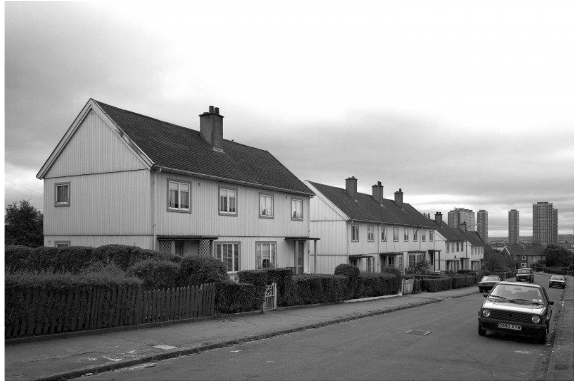
Swedish Houses Types B and C, Eastburn Road, Balornock, Glasgow

However, by far the majority in Scotland were erected in larger estates within towns and cities. Two estates of 50 homes each still remain In Edinburgh (in the West Pilton and Sighthill areas). The Glasgow Balornock development is even larger. Cooke's paper<sup>(9)</sup> gives it a number of 200 with a total of 3,500 for Scotland as a whole. In fact there appears to be 306 in Balornock. This discrepancy may be because more homes were added to the area under the second, 1949, order but needs clarification. Thus, whilst there are fewer locations in Scotland, there are far more actual homes than in England and Wales.