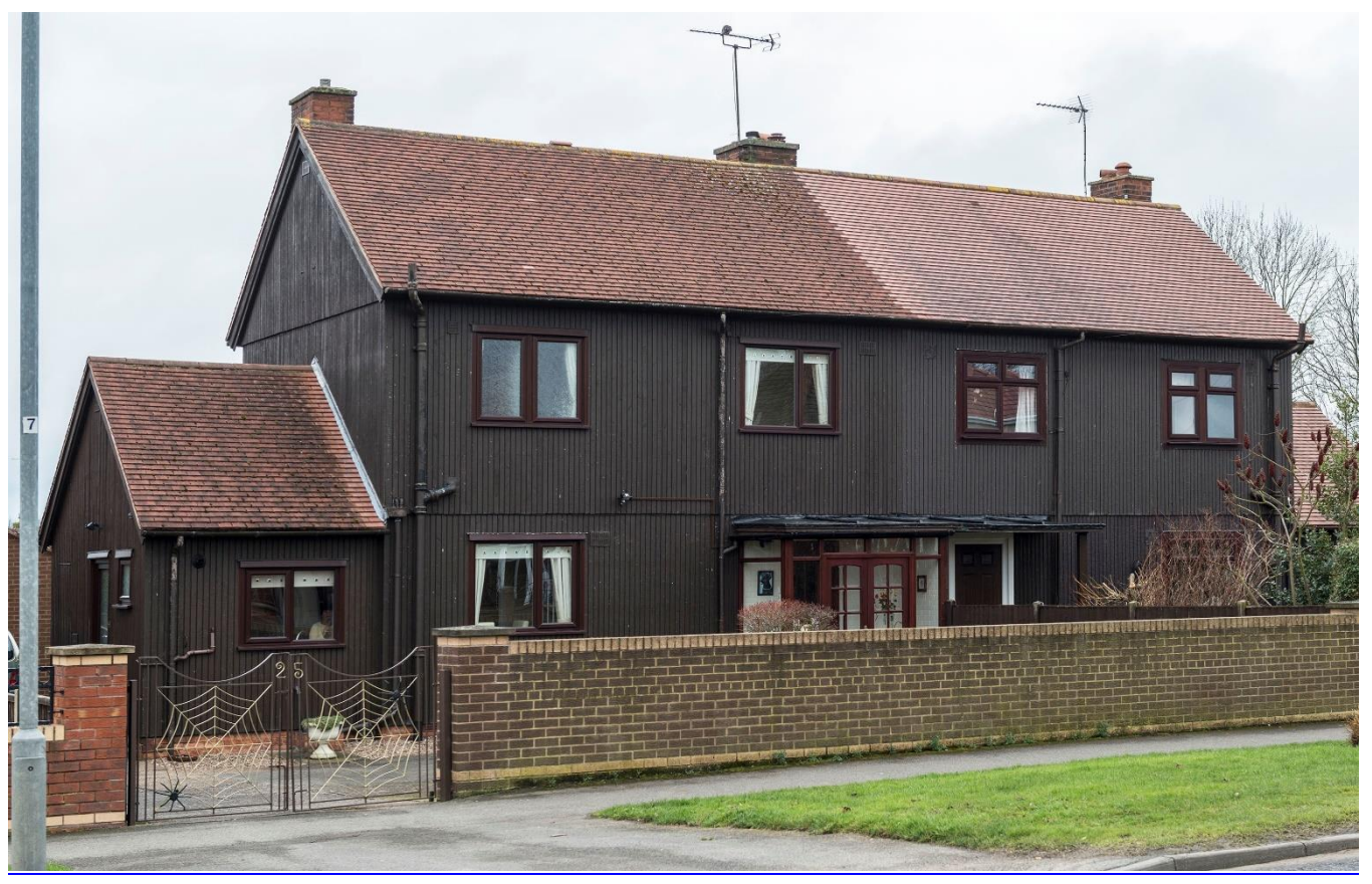
Swedish Houses Type A, Carlton in Lindrick (Des Hill)