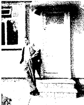
C:\Users\Mal\Pictures\AAA PREFABS3. Dad outside front step of prefab.jpg 256K