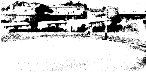
C:\Users\Mal\Pictures\AAA PREFABS1. View from the circle Murrayfield Avenue looking toward The Fordrough..jpg 64K