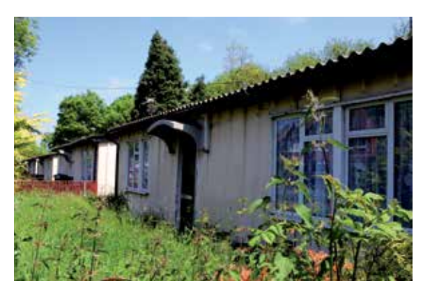
The Wake Green Road prefabs, June 2016.

There was great support for the Trust's The prefabs (a row of 17 of which 16 proposals to take on the six vacant buildings