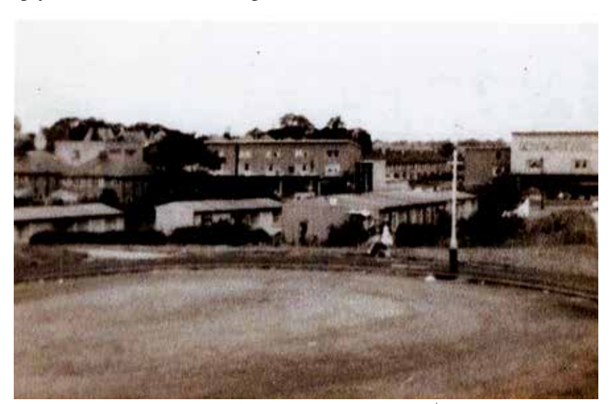
Murrayfield prefabs circa 1960/61. In the background are the shops of The Fordrough.

The first thing I remember was my mother's anger at the overflowing metal dustbin left in the front garden and sitting on the top was an empty blue salmon tin with a picture of a woman in a hat with a feather.