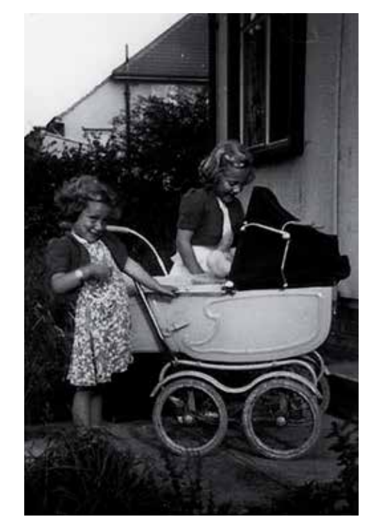
Children outside their Murrayfield Avenue prefab.

- probably too hilly to build on -became an adventure play area complete with a tree that was hanging over a small brook as well as lots of places to hide. Cowboys and Indians as well as hide and seek were played here. Traps were laid by tying tufts of grass together as trips. It was known as "fairyland", I don't think anybody knew why!